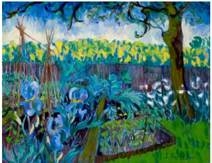
Oil Seed Rape by Oxfordshire based landscape artist Josephine Trotter

London contemporary art gallery Jonathan Cooper for 10 years, curating exhibitions there and at many of the major art fairs across London. She has staged exhibitions in London and one in Essex in partnership with The Redfern Gallery, London.